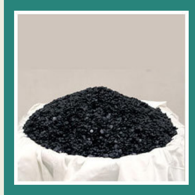
Nickel Catalyst Grade