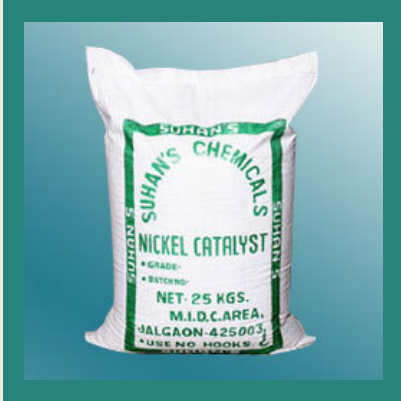
Nickel Catalyst Grade