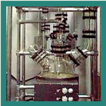
Metal Recovery Chemicals