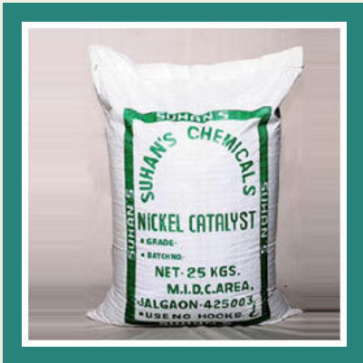
Nickel Catalyst Grade