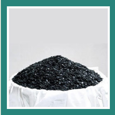
Nickel Catalyst Grade