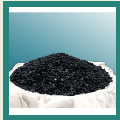
Nickel Catalyst Grade SCAT