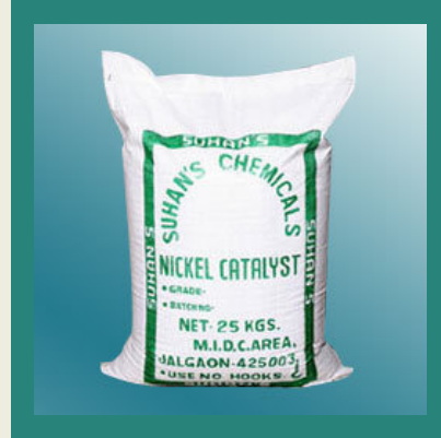
Industrial Dry Reduced Nickel Catalyst